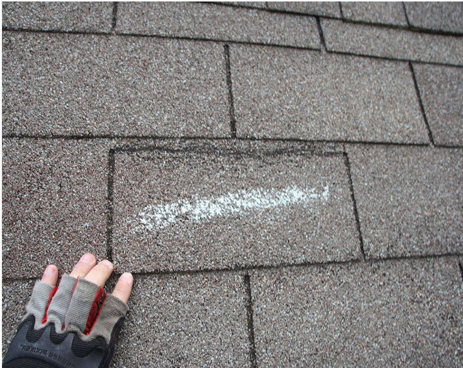
Figure 2 – Creased shingle tab.

This progression will tend to flip and crease or tear the shingle. The wind forces cause the shingle to flutter and bend such that further creases may develop ( Figure 2 ). Eventually, if the wind force is strong enough, the tabs or shingle sections break off and are carried downwind ( Figure 3 ). This is particularly the case in areas of the roof that are exposed to higher wind forces (e.g., eaves, hips, ridges, etc.). Failure typically occurs at the top of the exposed section, just below the butt end of the overlying shingle.