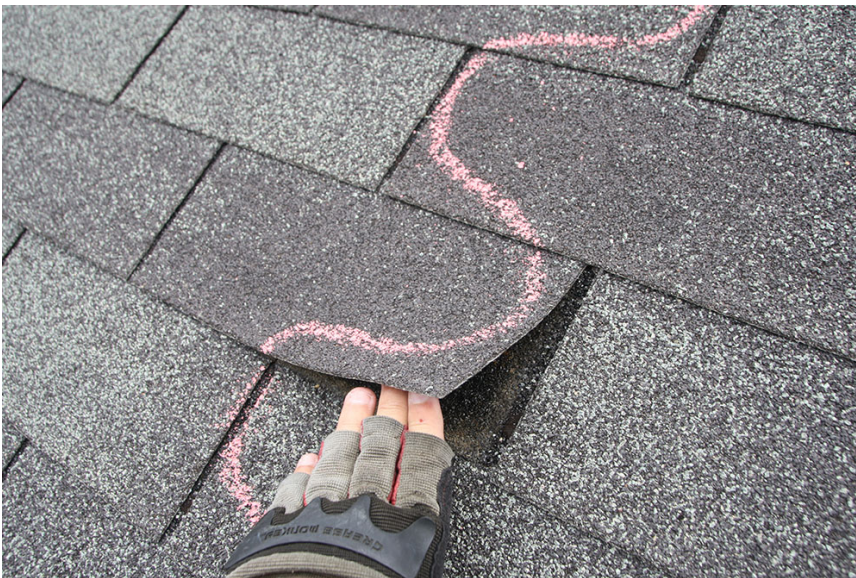
Figure 6 – Unbonded racked pattern of shingle overlaps.

Experiments by others have also concluded that unsealed shingles can occur in the absence of a high-wind event. In particular, recent research funded by the Southeast Region Research Initiative (SERRI), managed by Oak Ridge National Laboratory and conducted by The University of Florida (Dixon, 2013) for the U.S. Department of Homeland Security, found that “partially unsealed shingles were a result of a systematic failure of the shingle’s sealant strip rather than a random unsealing event.” Further, the study by Dixon et al. (2014) found that “shingles appear to remain sealed for