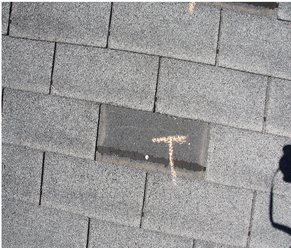
Figure 3 – Torn shingle tab.

This progression will tend to flip and crease or tear the shingle. The wind forces cause the shingle to flutter and bend such that further creases may develop ( Figure 2 ). Eventually, if the wind force is strong enough, the tabs or shingle sections break off and are carried downwind ( Figure 3 ). This is particularly the case in areas of the roof that are exposed to higher wind forces (e.g., eaves, hips, ridges, etc.). Failure typically occurs at the top of the exposed section, just below the butt end of the overlying shingle.