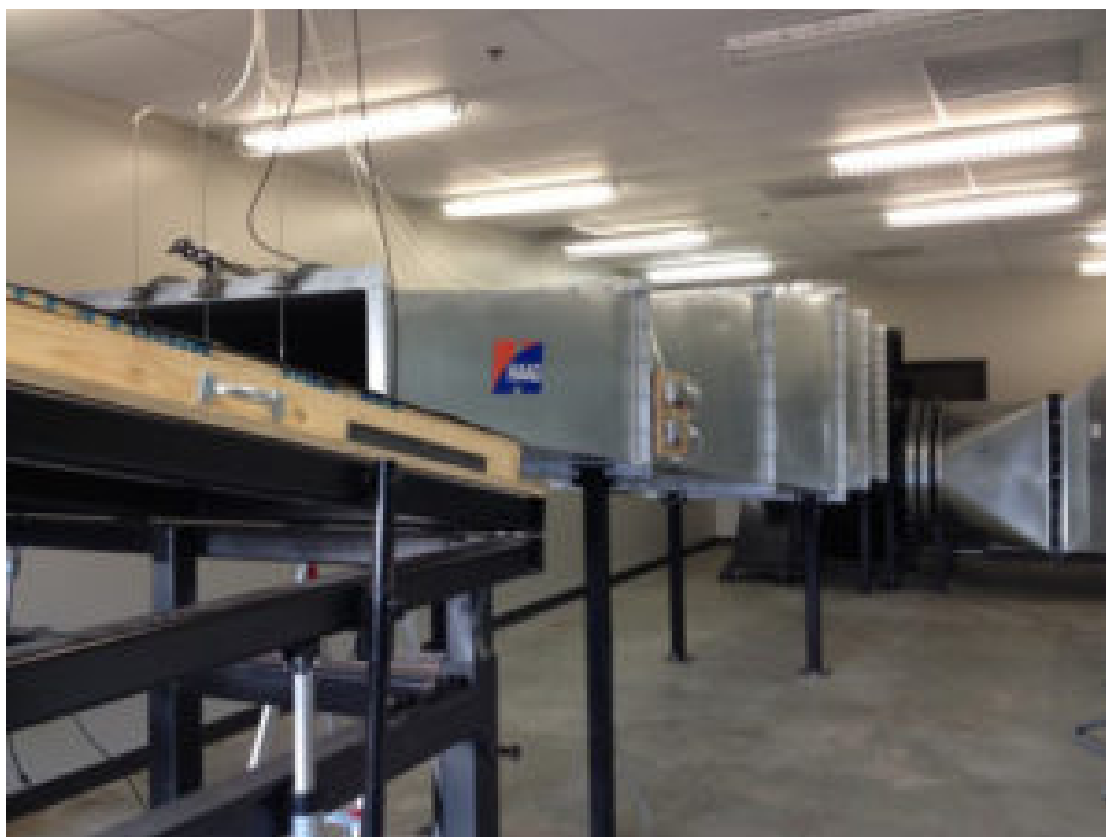
Figure 4 – Haag wind simulator.

A recently completed test performed by Haag Research/Testing (HRT) documented the mechanisms by which shingles are damaged by wind. HRT employed a wind simulator ( Figure 4 ) capable of producing wind speeds up to 175 mph and compliant with ASTM D3161, Standard Test Method for Wind-Resistance of Steep Slope Roofing Products (Fan-Induced Method) . Post-test inspection of all shingles that unbonded during the testing revealed that, at a minimum, creases were present. Shingles utilized in this test were not weathered, but were placed on the test assembly days before the test. In the new, pliable shingles tested, the creases required very close inspection and tactile manipulation (i.e., placing hand pressure from underneath the shingle) of the granular surface to observe the crease; nonetheless, they were present and observable.