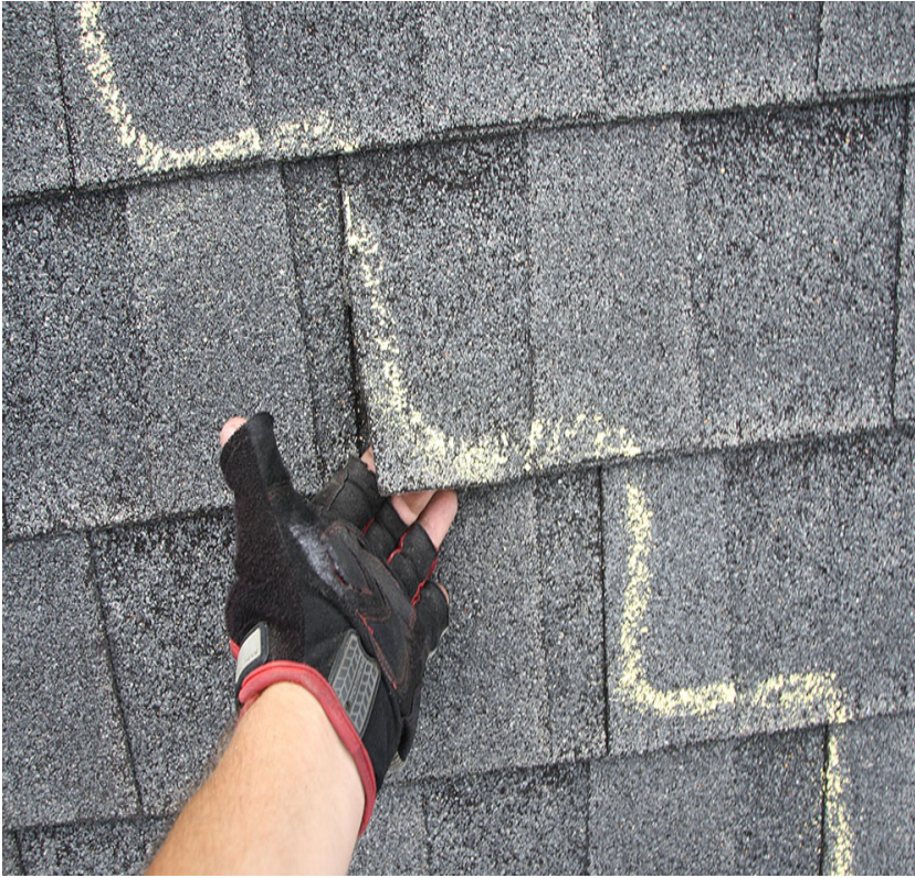
Figure 5 – Unbonded diagonal pattern of shingle overlaps.

Cyclic thermal expansion and contraction, for example, will yield a pattern of unbonded shingle overlaps extending up-slope diagonally, reflecting the pattern in which these shingles were installed ( Figure 5 ). A similar pattern is often observed with shingles installed in a straight-up pattern, referred to as “racked.” An unbonded pattern of shingle tabs in a racked installation is commonly referred to as zippering (chalk lines in Figure 6 show the nonbonded shingle portions). These unbonded overlaps will not vary in direction or increase/decrease in areas of the roof where wind uplift would be greater/less. In such cases, it is clear that wind would not come from all directions with just enough force to compromise the adhesion on the sides of the shingle overlaps.